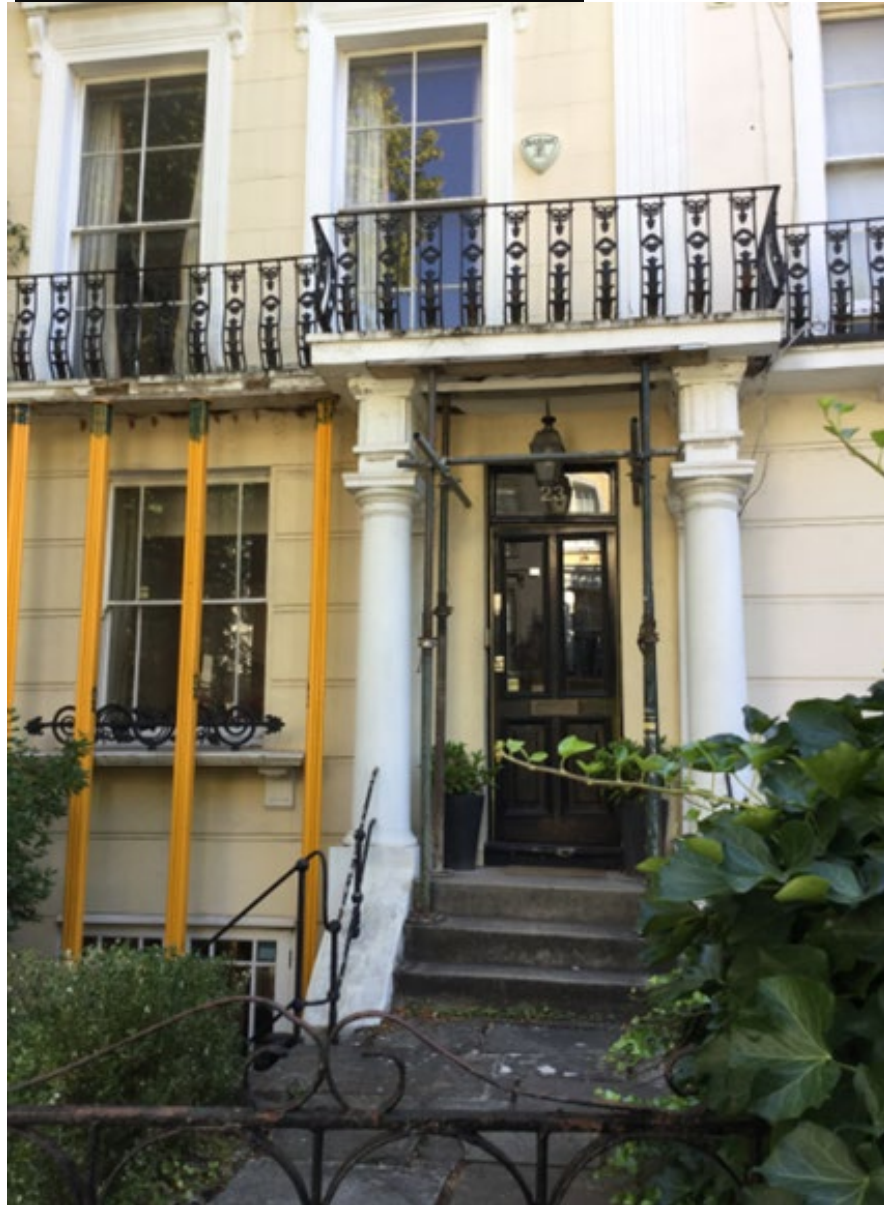
Front Elevation Prior to Removal of Balcony